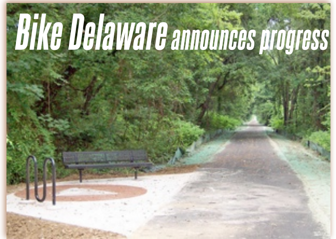
Looking north towards Wilmington from near New Castle on the Wilmington - New Castle Greenway