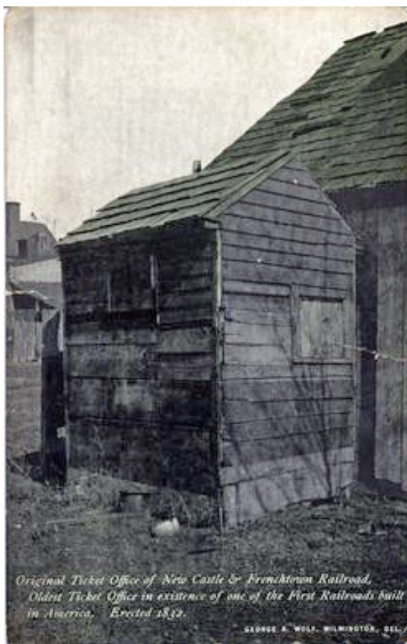
Original Ticket Office of New Castle & Frenchtown Railroad. Oldest Ticket Office in existence of one of the first Railroads built in America. Erected 1832.