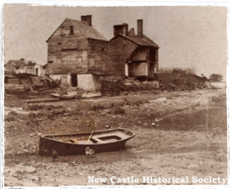
New Castle Historical Society