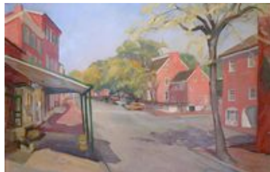
Old New Castle 24x40