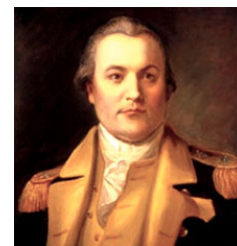
Col. John Haslet