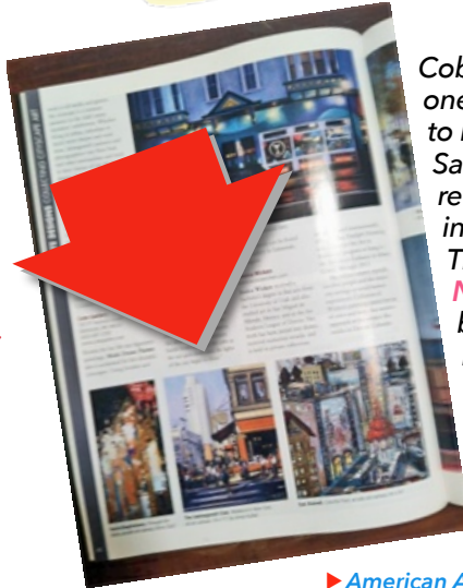
► American Art Collector