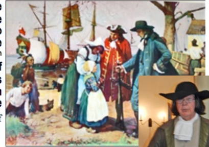
William Penn at New Castle Delaware

New Castle Court House Museum to Commemorate 330 th Anniversary of William Penn's landing in New Castle In celebration of