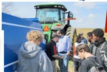
Students being introduced to the "Subsurfer"