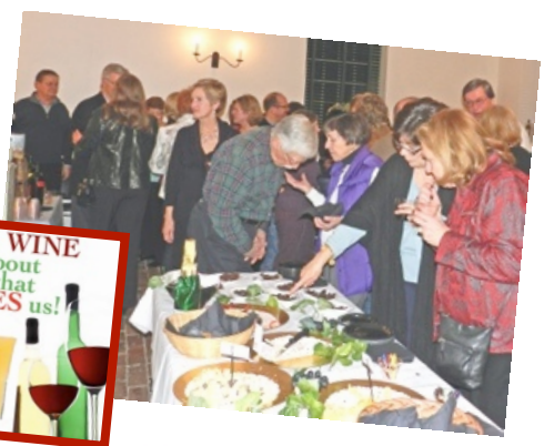
Gov. Markell visits Penns Place