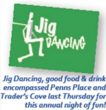
Jig Dancing, good food & drink encompassed Penns Place and Trader's Cove last Thursday for this annual night of fun!