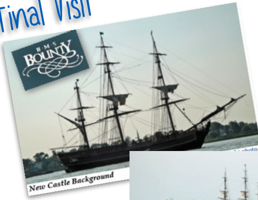
New Castle Background