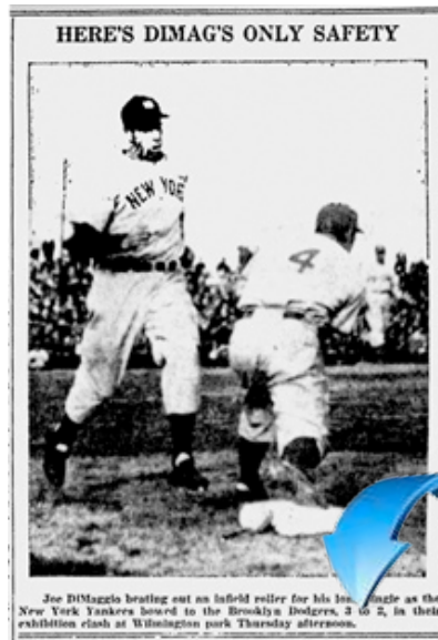
Joe DiMaggio batting out an infield roller for his lone bingle as the New York Yankees bowed to the Brooklyn Dodgers, 3 to 2, in their exhibition clash at Wilmington park Thursday afternoon.

YOUR FAVORITE GATHERING PLACE SINCE 1984