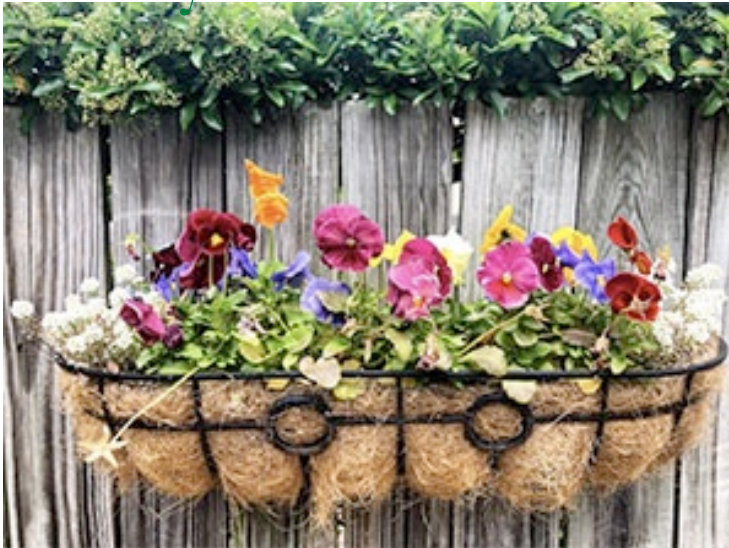
Leah Reynolds PHOTO