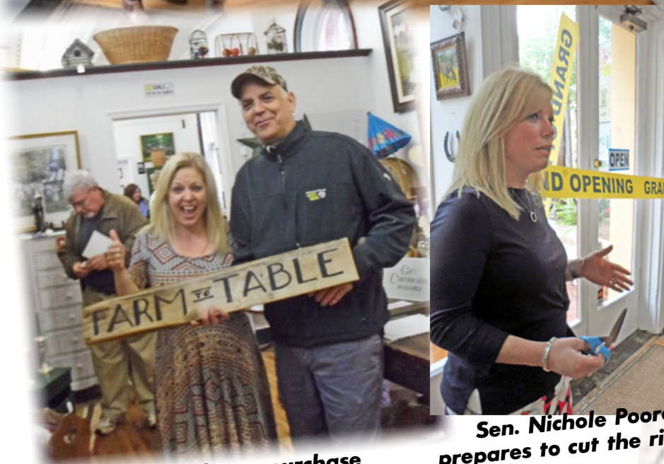
Jay makes a purchase Sen. Nichole Poore prepares to cut the ribbon