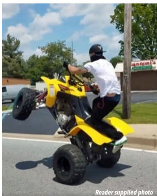
Reader supplied photo