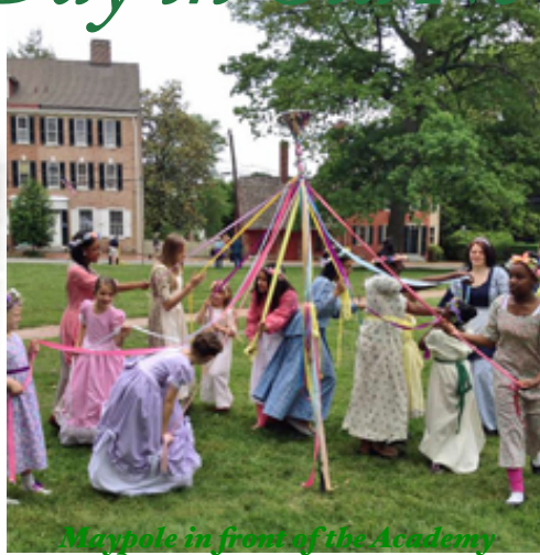
Maypole in front of the Academy