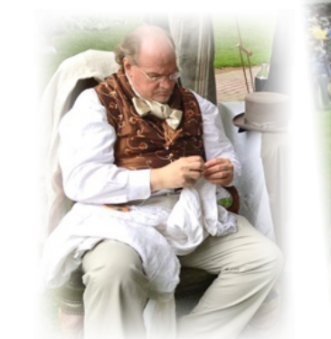
Attention to details