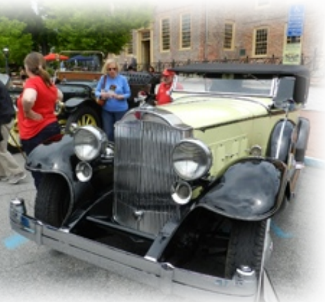
Rolls Royce display