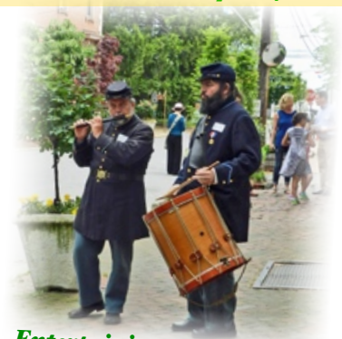
Entertaining on every corner