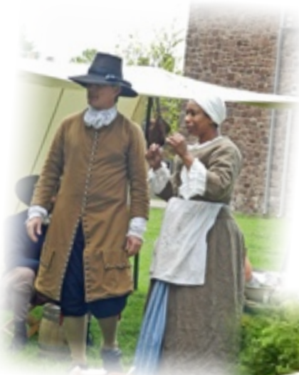
Displaying Colonial wares