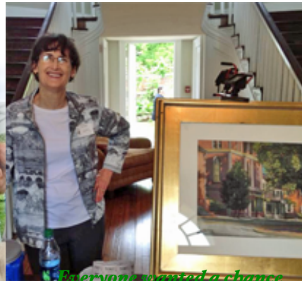
Everyone wanted a chance