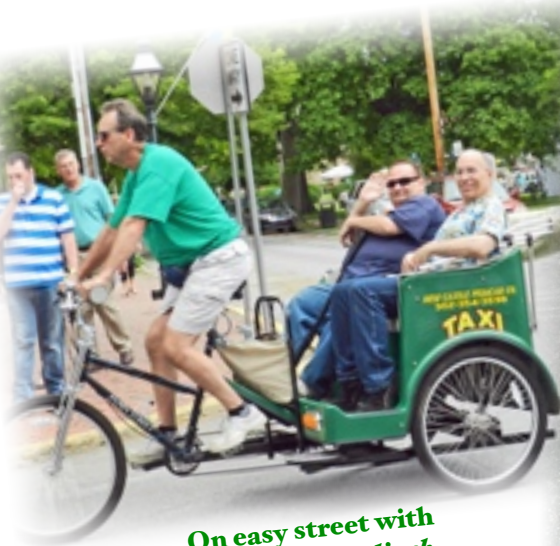
On easy street with New Castle Pedicab