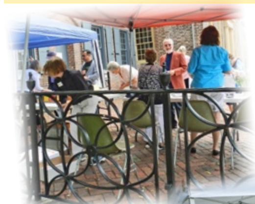
Brisk ticket sales