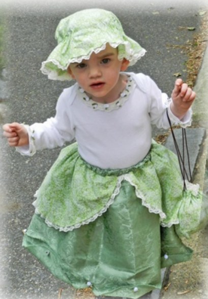
This little Miss will see you May 17, 2014!