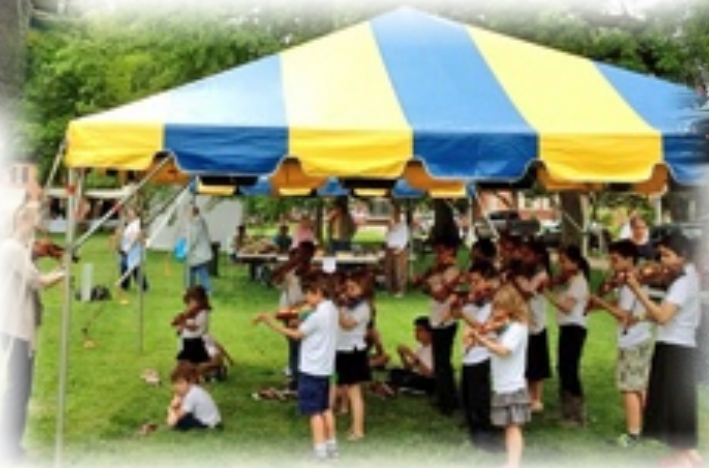
The Suzuki Violin Students