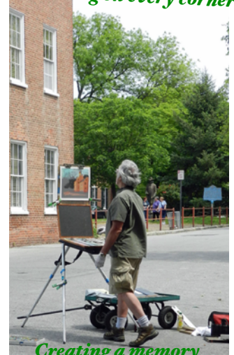
Creating a memory