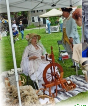
Spinning and greeting