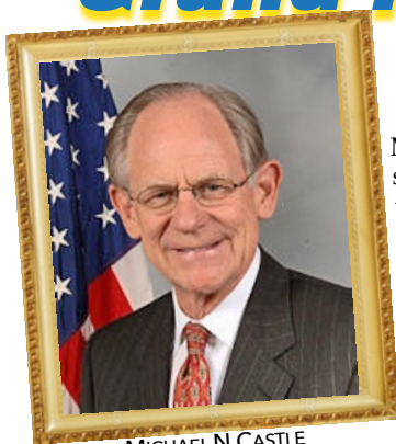
MICHAEL N. CASTLE