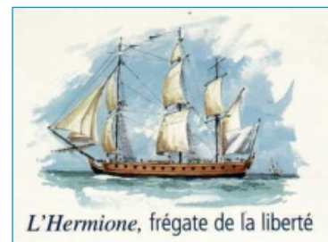
L'Hermione, frégate de la liberté

George Washington Society, Ltd Cordially invites you to "Hermione Voyage 2015" Lafayette's Ship