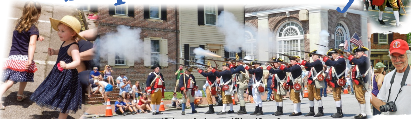
1st Delaware Regiment and Fife and Drum Corps