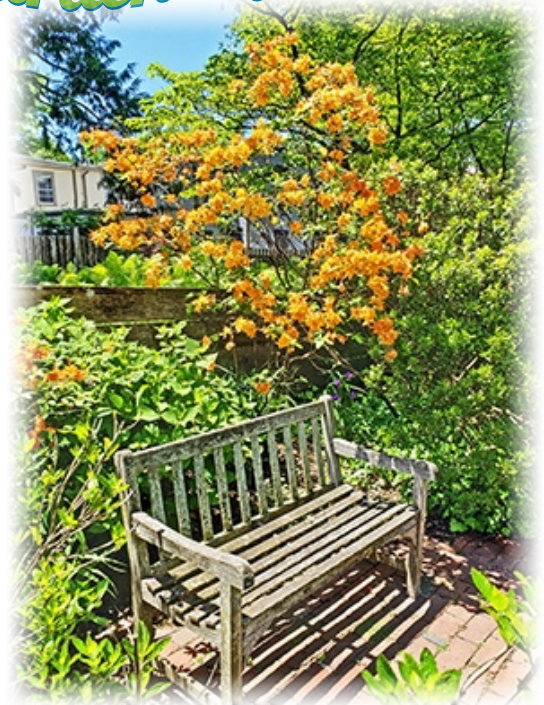
Amstel House garden