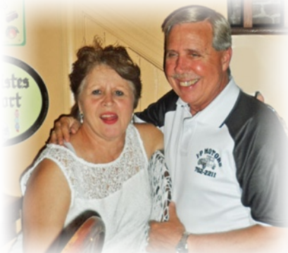
The Anniversary Couple