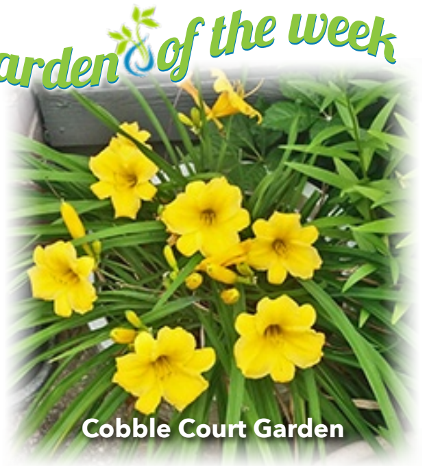
Cobble Court Garden