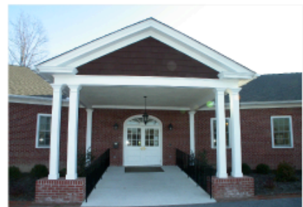
private entrance with handicap accessibility

Bring your own food, liquor, linens, decorations & other supplies. Parking available for up to 43 cars. Additional parking on the street. Rates: $600.00 for 6 hours. Additional hours @ $40.00/hour. Requires $200 deposit at reservation. Subject to availability. Call for more info.