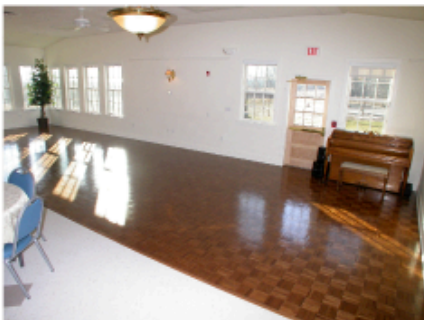
parquet dance floor

State-of-the-art kitchen with refrigerator, freezer, plenty of workspace, 8-burner gas stove, two ovens, microwave, prep area with sink, separate washing sinks, & work tables adjacent to dual pass-through/serving windows and doors to main dining room. Two outside doors allow easy unloading for caterers or other service people.