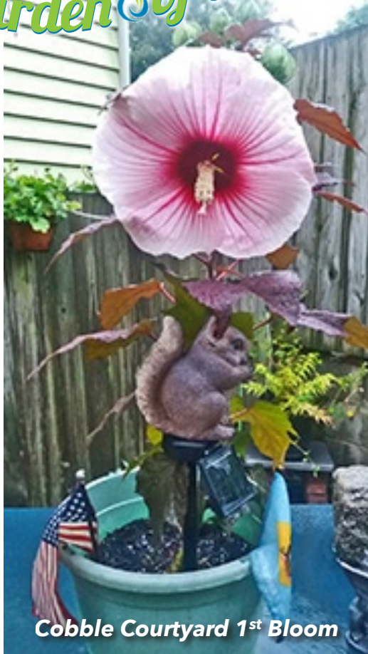
Cobble Courtyard 1 st Bloom