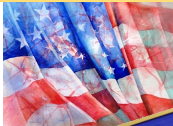
"Old Glory" by Bonnie White