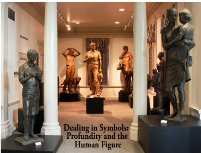
Dealing in Symbols: Profundity and the Human Figure

Ongoing at the Old Library Museum, explores the history of drinking establishments – both legal and illegal – in New Castle since the 17th century. At the Old Library Museum, Weekends (excluding holidays), 40 E. 3 rd Street, 1pm to 4pm Free.