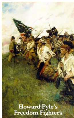
Howard Pyle's Freedom Fighters

On the home front, Delawareans experienced the war firsthand during the Philadelphia campaign of 1777, when British troops crossed through the northern part of the state and occupied the city of Wilmington. The Battle of Cooch's Bridge was fought near Newark as American light infantry tried to delay the British advance through the state.