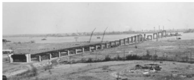
The Delaware Memorial Bridge Contract #6 - American Bridge Co. March 17, 1950 - No. 3 - Showing West Approach