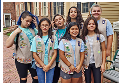
Girl Scout Troop 420 Chesapeake Bay Service Unit 45

Click on this link www.ndeovariancancer.org