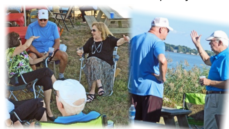
All hands waving