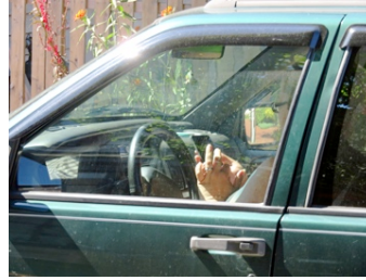
Pokémon driver on W. 3rd Street