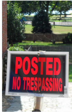
Residents have posted their own signs.