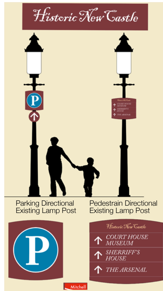
Parking Directional Existing Lamp Post

The next phase is fabrication and installation of pedestrian wayfinding signs and parking directional signs in the city center and Battery Park with assistance from the City, MSC and Trustees.