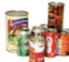
Metal cans (can lids and clean foil)