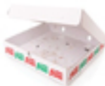
Pizza Boxes (empty) (no food residue)