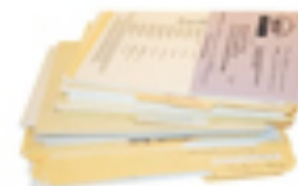
Office paper and file folders