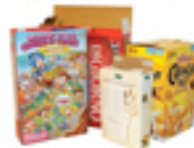
Paper board boxes