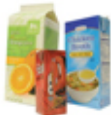
Aseptic containers and cartons