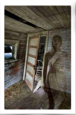
Mon. Jan 30th 10am

Women's Tennis vs. Opponent TBA (at Elkton, Md.) 6PM