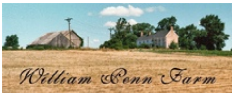
William Penn Farm