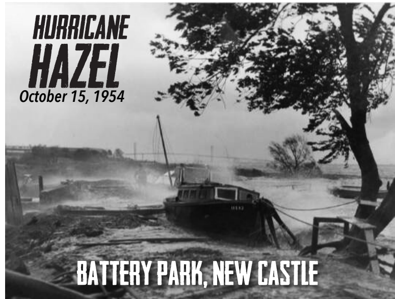
HURRICANE HAZEL October 15, 1954