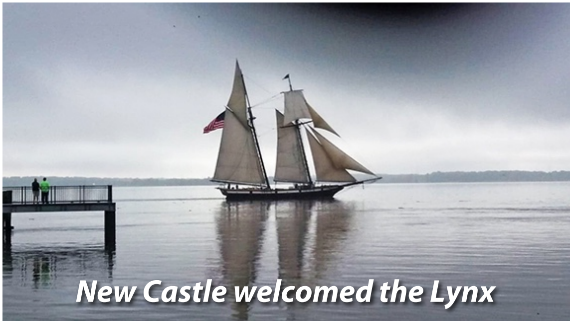
New Castle welcomed the Lynx