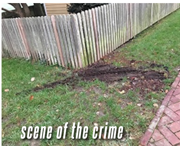
scene of the crime

The recent thefts from businesses and residents who do their best to beautify our town call for a solution. More police presence and the use of street cameras are comments heard on the street.