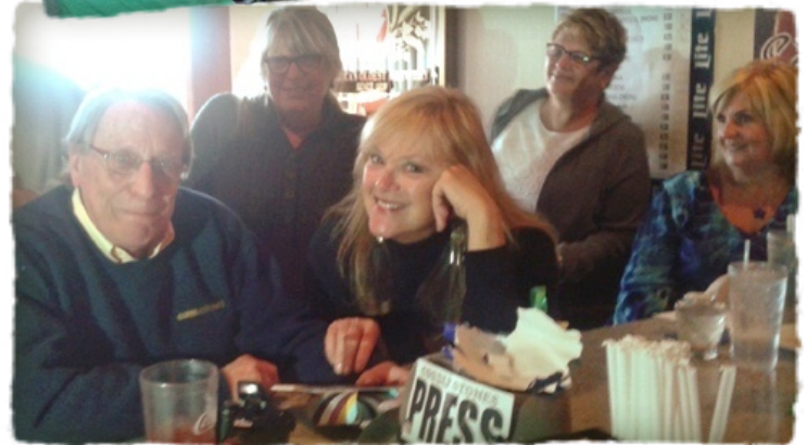
I'm surrounded and loving it!