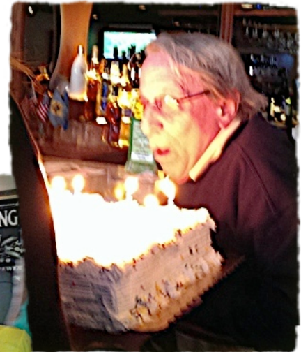
▲ Fire in the hole!