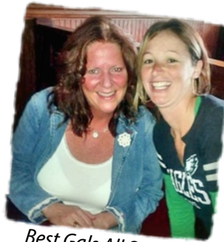
Best Gals All Smiles