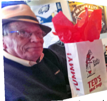
HOT DOG...whata afternoon!