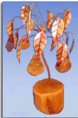
Oils, Acrylics, Watercolors, Photography, Sculpture