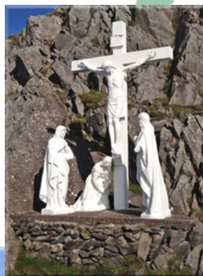
◀ Christ on the cross found on the Sleah Head Drive on the Dingle Peninsula