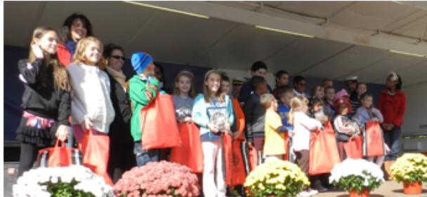
WINNERS - TAKE A BOW