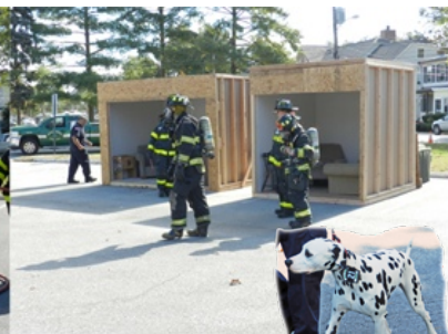
Both structures had smoke detectors and burned freely. On the left, the structure with sprinkler was saved on the right without was heavily damaged. and SPARKY was ther too!