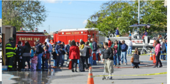
INSPECTING THE DAMAGE