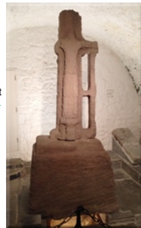
St Patricks cross at the rock of cashel. ▶