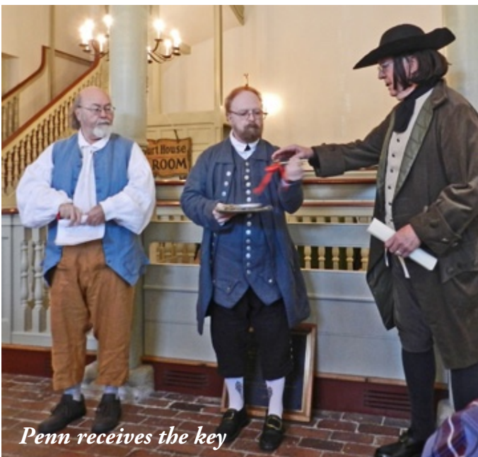
Penn receives the key

The New Castle Court House Museum hosted a day long series of events commemorating the 336th anniversary of Penn's Oct. 27, 1682 arrival at New Castle, the site of his first landing in the New World. The morning started with the Livery of Seisen reenactment. Penn had received a grant of land from Charles II of England for the land of Pennsylvania but he received the land comprising Delaware from the King's brother, James, Duke of York. This Penn called his 3 lower counties of Pennsylvania. To formally claim his property he must go through an ancient English ritual of transferring land from one owner to another; this is called Livery of Seisen. The Symbols were: A handful of dirt, representing the land, a twig, representing all that grows on the land, a cup of water, all water resources on the land, and in Penn's case, a key, representing the town and government. A Baroque music concert, "1670 Trial of William Penn" (historical play on the 1670 trial of Penn), tours of the Museum, among others rounded out the day.