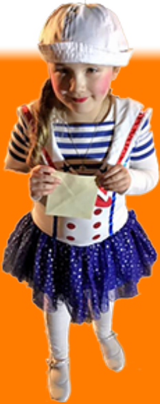
Parade Pictures on Page 9

The police department has received concerns from various residents regarding quality of life issues involving the Famous Pats establishment located at 735 Ferry Cutoff. In response, the police department is hosting a community meeting on Monday November 5 th , 2018 at 6:30 pm in the community room at the New Castle City Police Department, 1 Municipal Blvd, New Castle, DE 17220, to provide residents with a platform to discuss those concerns. Agents from the Division of Alcohol and Tobacco Enforcement (DATE) will be in attendance as well. The public is invited to attend.