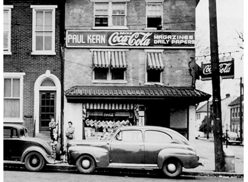
2nd and Delaware Streets