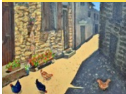
"French Village" by Nancy Saunders