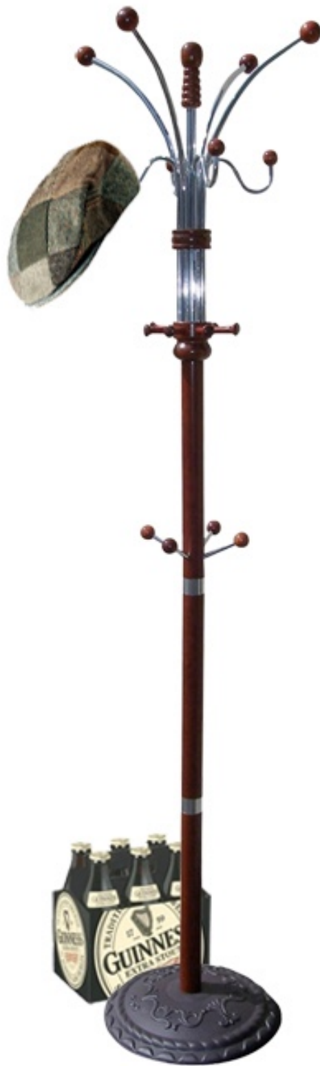
Jack Hat Day ~ November 29, 2018