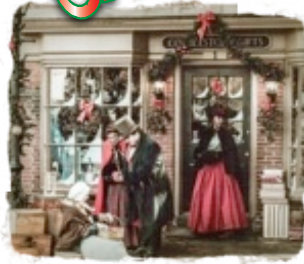
A Dickens Experience page 4