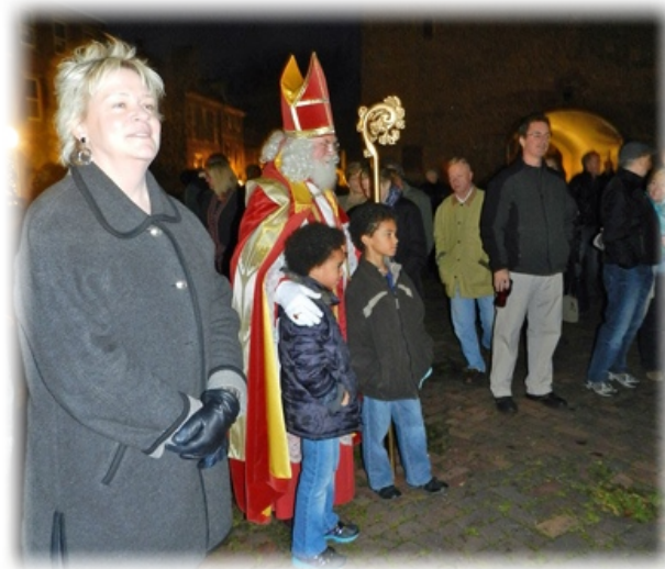
Enjoying the evening concert by the William Penn Chorale