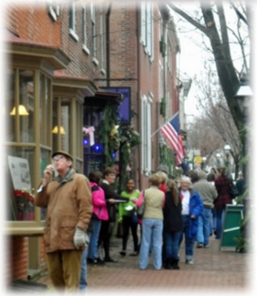
Visitors deciding what's next on their agenda