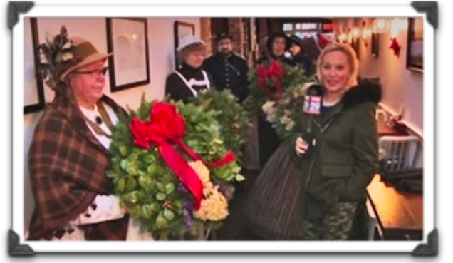
Arasaph Christmas wreathes were featured

https://allevents.in/new%20castle/new-years-eve-luray-productions/80002632598968 or call (302) 559-0607