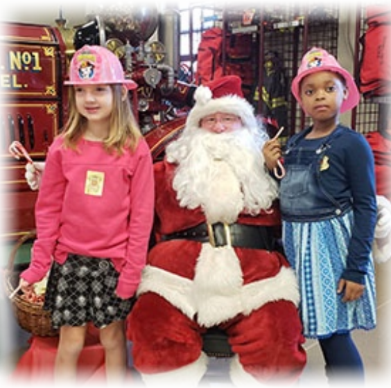
◀ Little Wishes