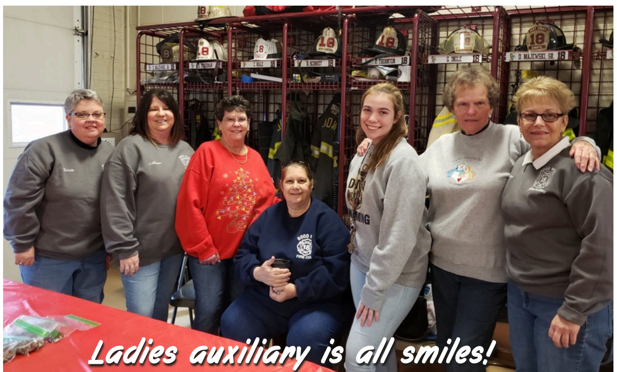
Ladies auxiliary is all smiles!