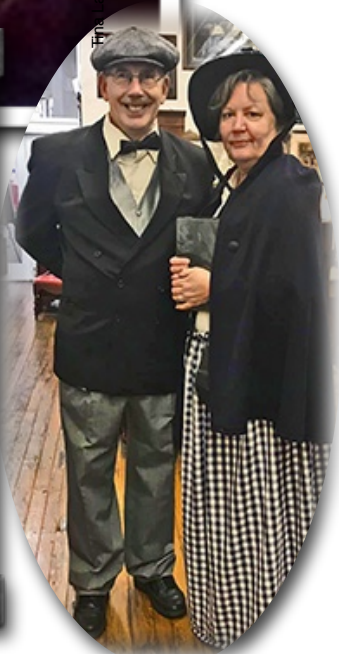
M & M New Castle and M & M Christmas