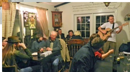
A FULL HOUSE OF FUN