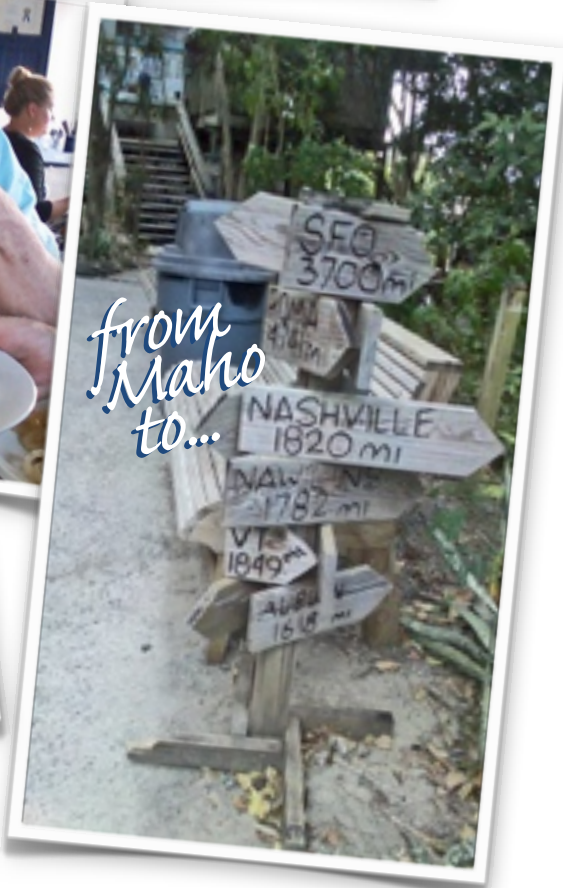
from Maho to...