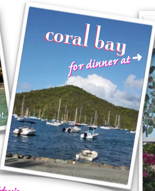
coral bay for dinner at →