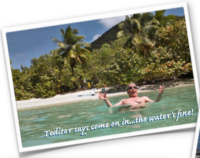
Teditor says come on in...the water's fine!