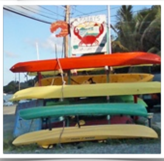
crabby's has it!