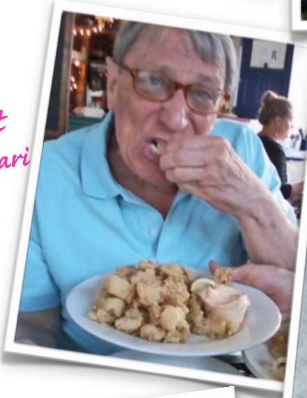
first calamari →