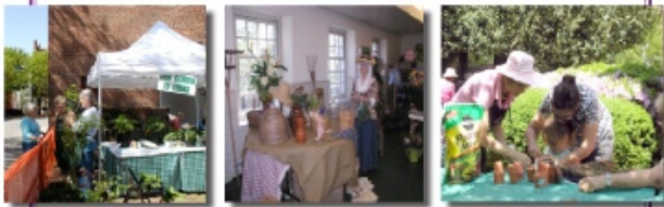
PROCEEDS TO KEEP OUR HISTORIC GARDENS GROWING

MARKET SQUARE • HISTORIC NEW CASTLE, DELAWARE