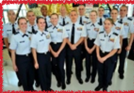
Delaware Diamond Flight Drill Team