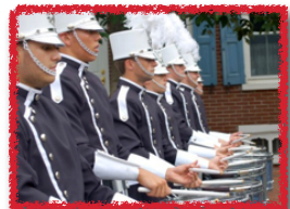
Jersey Surf Drum & Bugle Corps