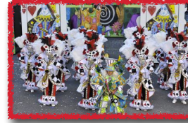
Avalon String Band