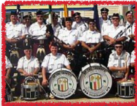
Irish Thunder Pipes & Drums