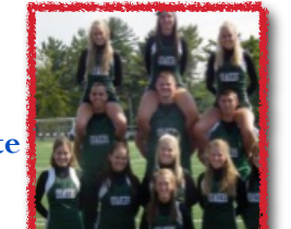
Wilmington University Cheerleaders