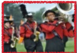
William Penn Marching Colonials