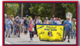
The Original Hobo Band