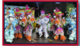
Avalon String Band