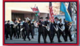
Citizen's Hose Company Band

Sponsored by STATE OF DELAWARE THE SEPARATION DAY COMMITTEE TRUSTEES OF COMMON MAYOR & COUNCIL OF NEW CASTLE FOR INFORMATION PLEASE CALL MAYOR'S OFFICE (302) 322-9802 E-MAIL - MIKKI@NEWCASTLECITY.ORG