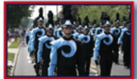
Jersey Surf Drum & Bugle Corps