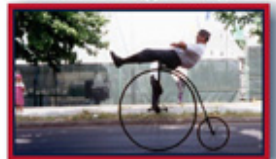
The Wheel Man