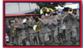
287th Army National Guard Band