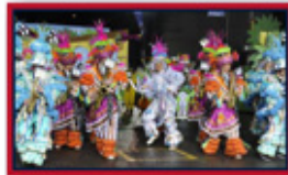
Avalon String Band