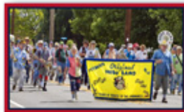
The Original Hobo Band