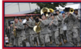
287th Army National Guard Band