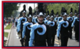
Jersey Surf Drum & Bugle Corps