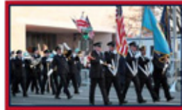
Citizen's Hose Company Band