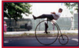
The Wheel Man