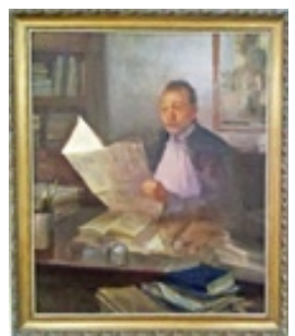
Look...a Chinese Teditor!