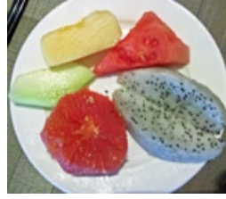
Name these breakfast fruits!

Globetrotting Cobblestone Bryan is business hopping all over Asia this month. Can you guess what he was served for breakfast?