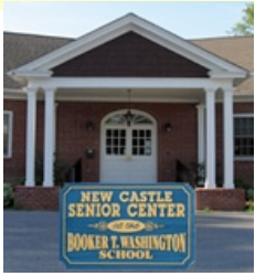
"Where Friends Gather"

Mon 8/22 - 10am Osteoporosis Screening 12:15pm Geriatric Foot Health Tues 8/123 - 12:30pm Brain Boosters Wed 8/24 - 9:30am Driving Tour Of Newark 4pm Dinner out-Newport (carpool only- no bus) Thurs 9/25 - 12:30pm Grocery Store 5pm Astrology w/ Patty Finlayson Fri 8/19 - 9:30am Breakfast before Bingo 12:30pm Ice Cream Corral